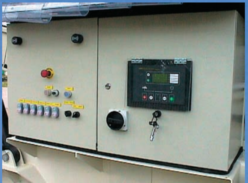
All controls are incorporated in a water proof control panel.