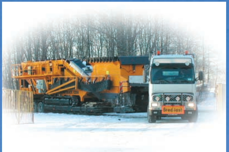
Compact design for road transport with a hydraulic assisted quick set up time.