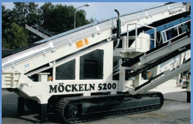
Power is supplied by a diesel generator. The plant can also be ran from the mains power supply.