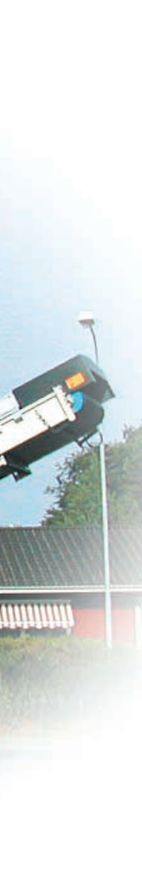
VH8 Mockeln. capable of